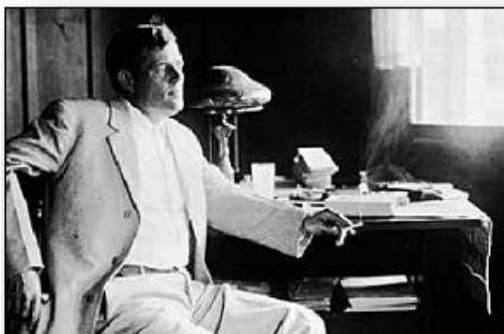
Jack London (1876 - 1916)